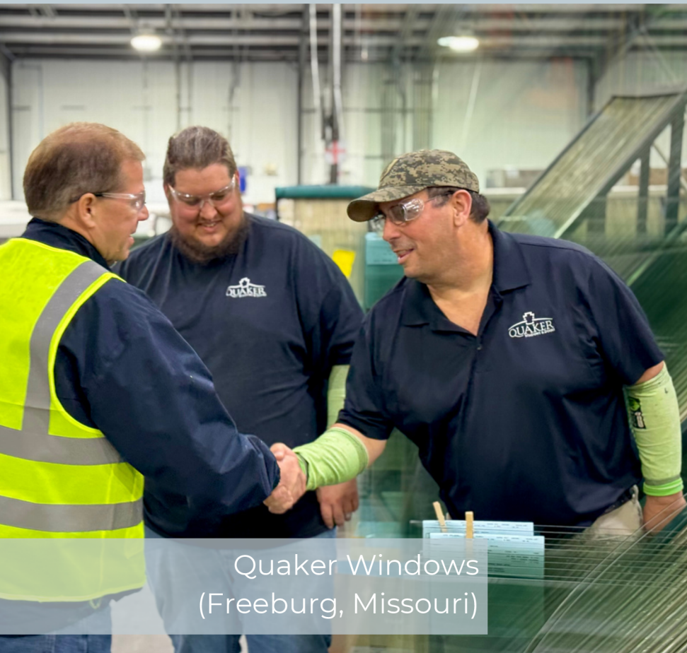
Quaker Windows (Freeburg, Missouri)

This guide is designed to help you “Stop, Shop, and Support” the enterprises you’ll encounter along Route 66. By choosing Missouri-made products, you aren’t just buying a souvenir, you’re investing in the people who call this state home. Enjoy your trip, and don’t forget to #BuyMissouri.